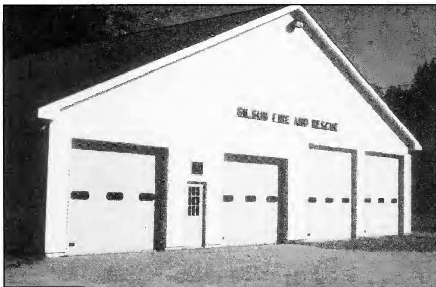
Gilsum Fire Station Addition Completed in 2000